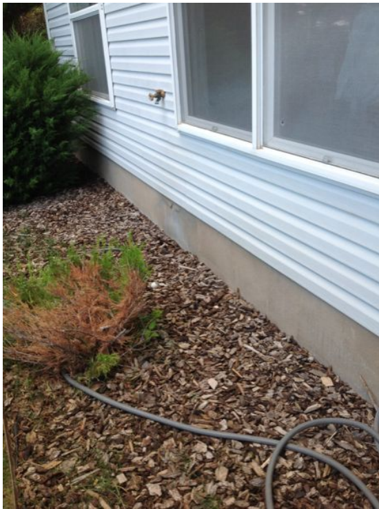
Other issues in Inspection Checklist