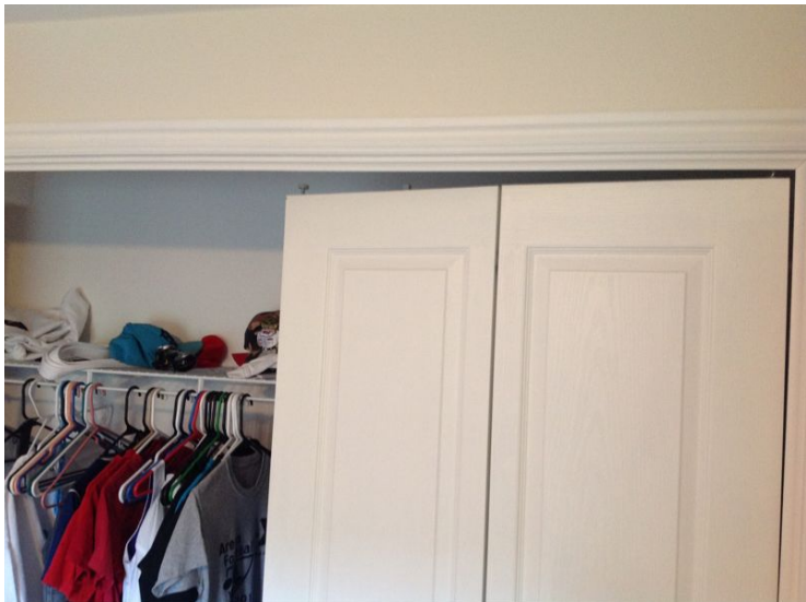
Doors/Locks in Inspection Checklist