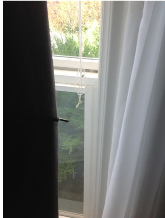
Blinds in Inspection Checklist