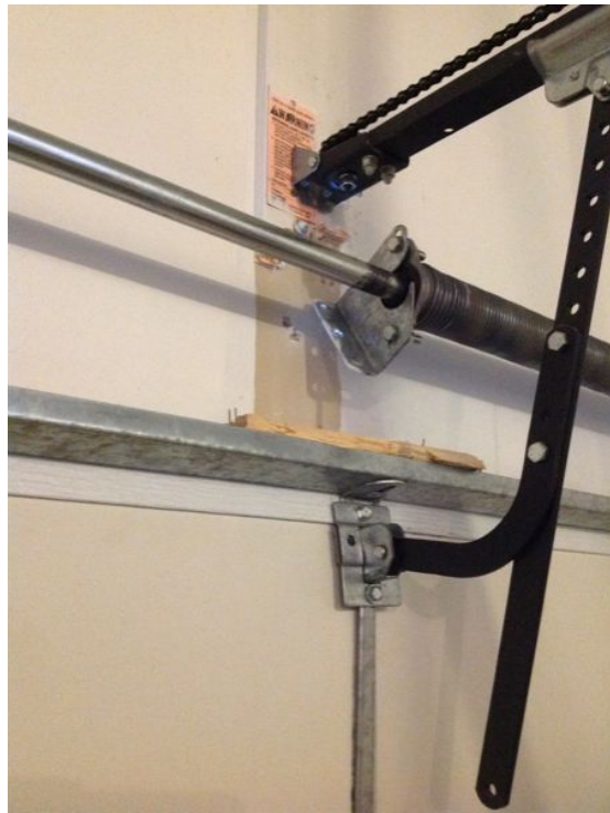
Other issues in Inspection Checklist