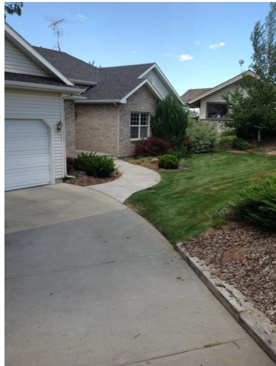
Exterior (siding, roof, lawn, flower beds) in...