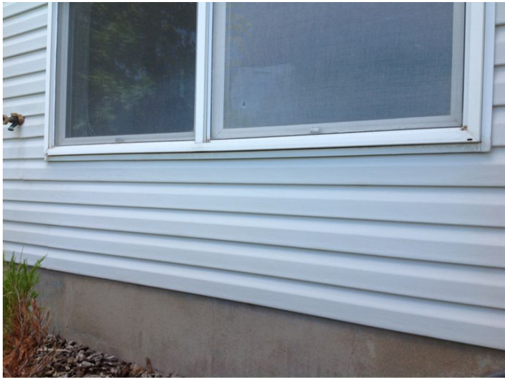
Window Screens in Inspection Checklist